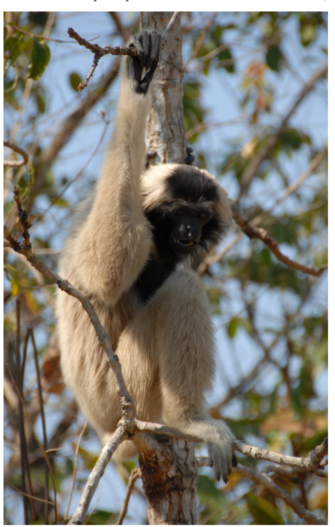
Figure 3. A Pileated gibbon, Hylobates pileatus , in Phnom Tamao Wildlife Rescue Centre outside Phnom Penh, Cambodia.

The objective of the workshop was to reignite regional networking and information sharing amongst conservationists working with small apes, and to develop a practical "IUCN Reintroduction,