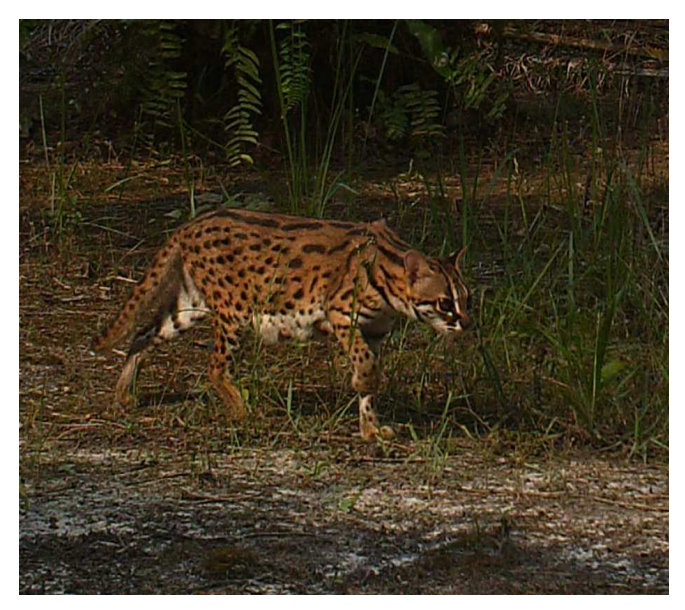
Figure 1. Leopard cat, Prionailurus bengalensis , stalking rats in an oil palm plantation in Central Kalimantan, Indonesia.

or compliment barn owls. A common predator in oil palm plantations is the leopard cat, Prionailurus bengalensis (Azlan et al., 2013; Grassman, 2000, 1998; Grassman et al., 2005a, 2005b; Rajaratnam, 2007) (Fig.1). With a body-weight ranging between 2.5-4kg it is considerably larger than a barn owl's 0.4-0.7kg. Therefore, it is expected to consume much more food and it may be a better biorodenticide than barn owls, provided the cats are are found in sufficiently large numbers.